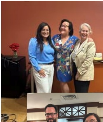
Shenandoah Children's Literacy Conference